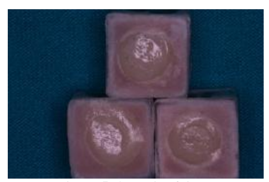
Figure 5. Adhesive failure