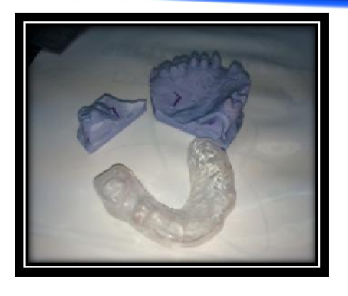
Fig. 3: Ridge (bone) mapping on the cast.

6-The exact drilling point was placed on the surgical stent depending on the resulted ridge which represented the direct bone without the covering keratinized tissue.