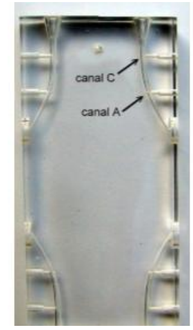
Figure 1: The clear block with simulated curved root canals

branched from each main canal, at right angles from the main canal axis. The most apical canal at 5 mm from the apical end of the main canal was labelled (A); the coronal canal was a further 6.5 mm more coronal than (A) and was labelled (C) (Figure 1).