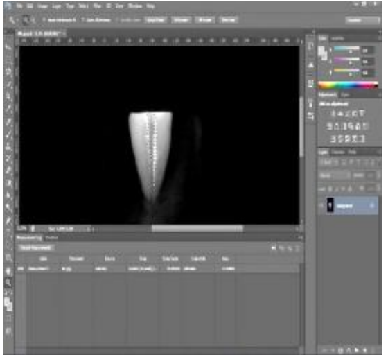
Figure 2: The Use of Adobe Photoshop CS6 Software and magnetic Lasso Tool to Measure the Area of the Remaining Filling Debris Area.