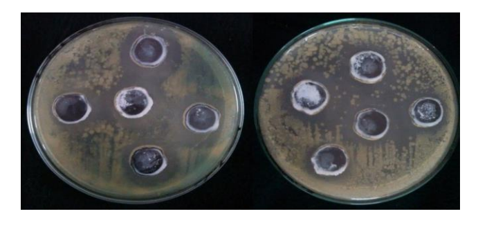
Fig 3: ZnO nanoparticle inhibited E. coli high as compare to S. epidermidis

Fig 2: Inhibition of growth after Chlorine disinfectant on NA and EMB agar