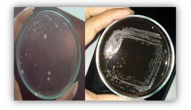
Fig 1:Inhibition of growth after UV disinfectant on NA and EMB agar

The outcomes of UV radiations in most of the wastewaters samples have been reported to be almost the same as those in chlorine, indicating that it had very heavy or high impact on inactivation of bacteria. After incubation the percentage of growth of microorganism after exposure with UV dose as a disinfectant treatment was found to be very low. Chlorine have inhibited 90% of microorganisms in all samples which is higher than that of UV.A chlorine concentration of 0.5 ml reduced the percentage of growth of microorganism to a detectable level. In E.coli and S.epidermidis both observe complete zone of inhibition. The presence of a large zone showed the antibacterial activity of ZnO nanoparticles. Size of the zone was distinctive as indicated by the sort of microorganisms, the size and the properties of ZnO nanoparticles. ZnO nanoparticle inhibited E. coli high as compare to S. epidermidis.