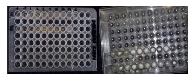
Figure 4: Results of inhibition of E. coli and S. epidermidis by ZnO nanoparticles