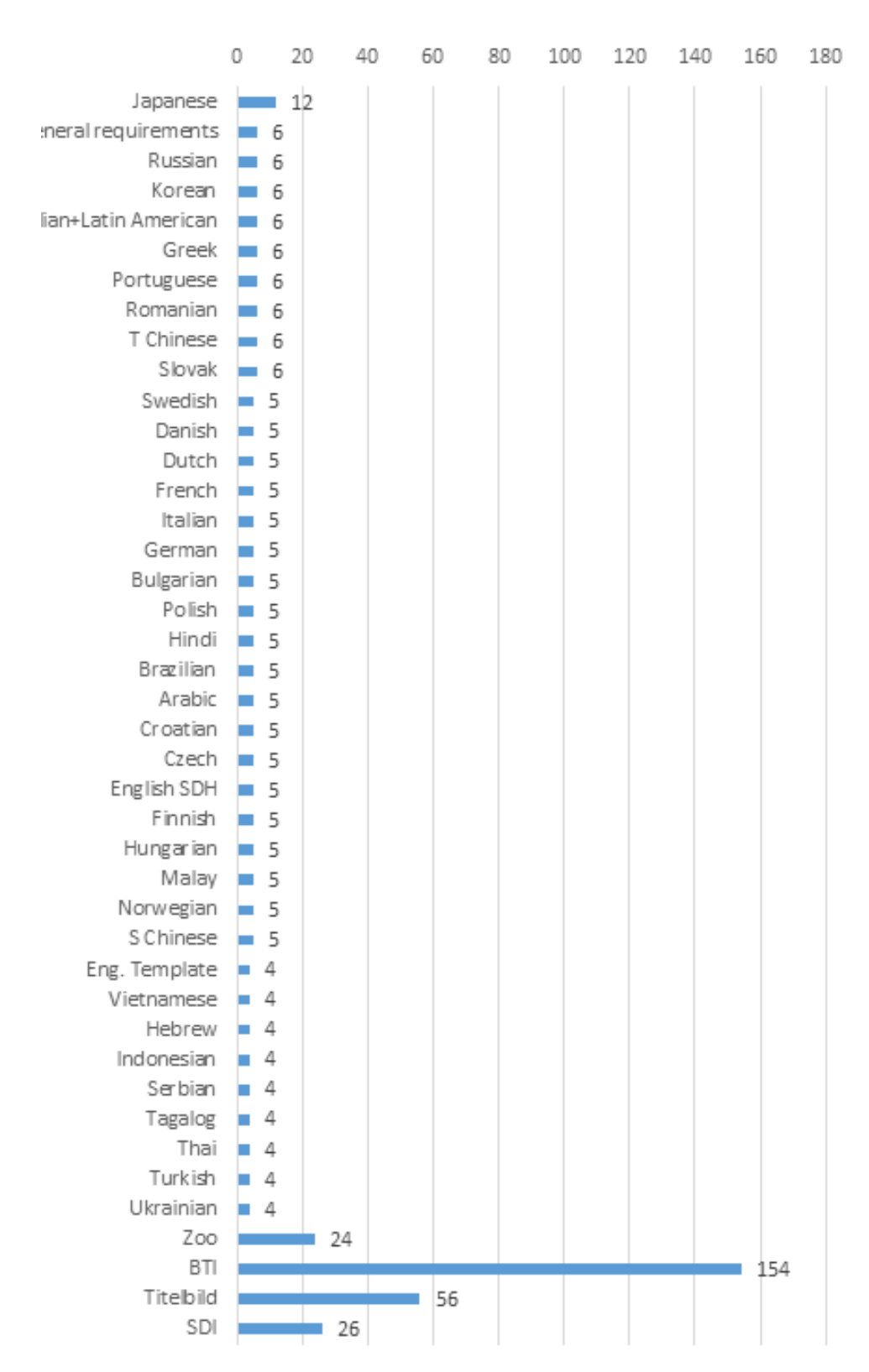
Figure 1. Guideline size in printed pages (excluding change log)

Figure 1 shows the number of printed pages of Netflix TTSGs, excluding the change log, compared to local guidelines of four other commercial companies that operate internationally: ZOO Digital, TITELBILD, SDI-Media and BTI Studios. The comparison may be seen as somewhat unfair,