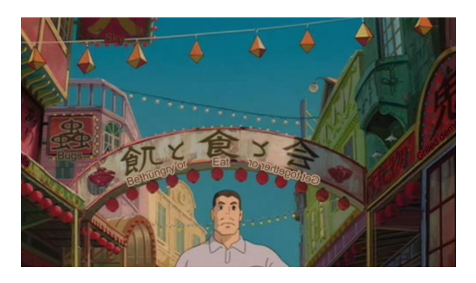
Figure 5 ?rehtegoT teG

Several interesting challenges arose while translating the signage, including the fact that some of the writing was not only written from right to left (that is, according to a now outdated mode of writing in the opposite direction to that of modern Japanese) but was sometimes mirrored as well, as is illustrated in Figure 5, where the latter third of the sign in the centre of the screen appears backwards.