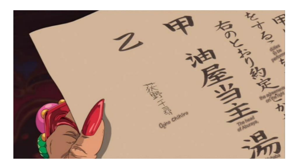
Figure 4 Chihiro Loses Her Name

there is little explanation for what is happening on screen in most translations. This leaves viewers who are not able to read Japanese confused as to how the name "Chihiro" can become "Sen" by merely deleting some of the writing.