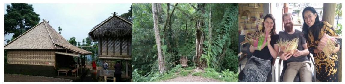
Figure 2. Illustrate the natural and cultural potential of Bali Aga Village (Andiani, 2019)

2020). So that the smile of the Bali Aga village community has provided a positive memory for tourists. In addition to the natural potential that supports, community culture such as strong community character makes visitors feel comfortable, because the community is very friendly. This community involvement shows that the concept of alternative tourism has been unwittingly applied in tourism development in Sidatapa and Pedawa villages.