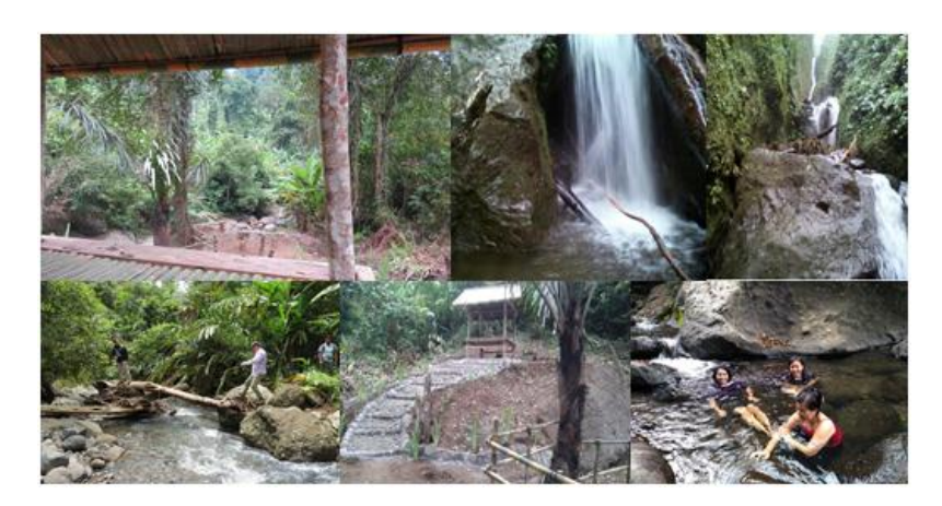
Figure 3: Mesehe trekking - Post 1

In order to maintain the tranquility of the forest that effects the visitors' experience, CBT Pohsanten will apply limit to the number of visitors using Mesehe trek. This limit is applicable to the both trekking routs either for the amateur or the professional.