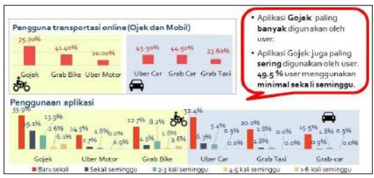
Figure 2: Online Transportation Usage and Applications

According to the results of research on 121 samples from https://sharingvision.com/research/ reports in August 2016, that at least 1 week once the online application is often used.