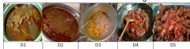
Figure 1. The Quality of 5 Beef Rendang Recipes in Payakumbuh as Darek Region

The recipes that have been obtained from MSMEs in the Darek region and Pasisia region were processed and assessed for quality using an organoleptic test questionnaire in terms of shape, color, aroma, texture, and taste. The quality picture of five beef rendang recipes in Payakumbuh City as Darek region and the assessment score data can be seen in Figure 1.