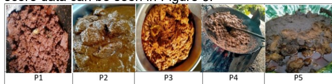
Figure 3. The Quality of 5 Beef Rendang Recipes in Pasaman City as Pasisia Region

The quality pictures of five beef rendang recipes in Pariaman city in Pasisia region and the assessment score data can be seen in Figure 3.