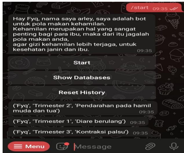
Fig 2. Data Tracking/History

The results of the trial are outlined in the form of a table, where the trial is carried out by checking repeatedly and comprehensively on the application so there is no bug or error in the system, and also in the user's test 4 times, namely pregnant women who have problems in pregnancy in Trimester in the pregnancy period.