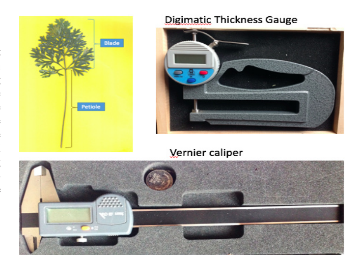
Fig. 1: Herbarium leaf of A. absinthium and devices for leaf measurements

Plant samples (g) were distilled in a Clevenger-type apparatus according to the method recommended by the VII. Hungarian Pharmacopoeia. Essential oils were extracted from 50 g dried leaves of each accession by hydro-distillation (500 ml water) for 2.5 hours.