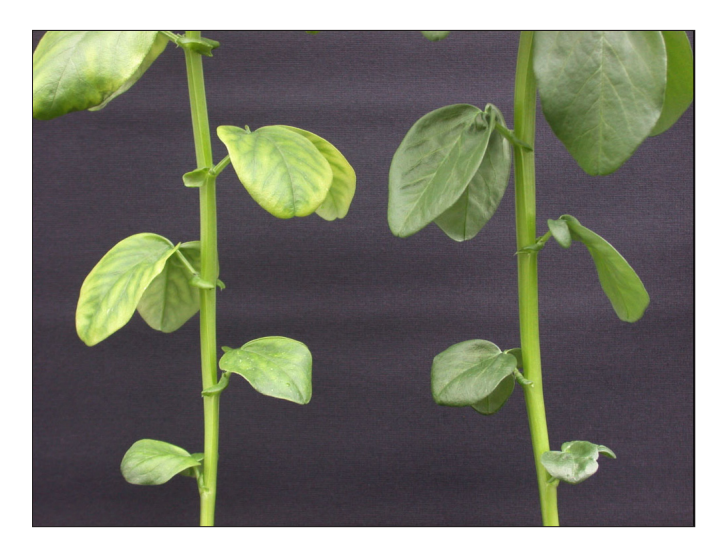
Fig. 1: Older leaves of Vicia faba plants show Mg deficiency symptoms (left; 0.05 mM MgSO<sub>4</sub>). Right side, leaves without deficiency (0.5 mM MgSO<sub>4</sub>).

The reduction from 0.5 mM MgSO<sub>4</sub> to 0.05 mM MgSO<sub>4</sub> induced a sever Mg-deficiency with the characteristic leaf intervenal chlorosis (Fig. 1). With respect to whole leaf Mg concentrations, a clear effect of the foliar supply became evident. Low MgSO<sub>4</sub> (0.05 mM) in the nutrient solution resulted in a concentrations of only 1.3 mg Mg/g dry matter (Fig. 2, negative control). The foliar application raised the concentration significantly to 15 mg Mg/g dry matter (200 mM MgSO<sub>4</sub> treatment), which was significantly higher than that in the positive control (3 mg/g dry matter) that was supplied with 0.5 mM Mg to the roots (Fig. 2).