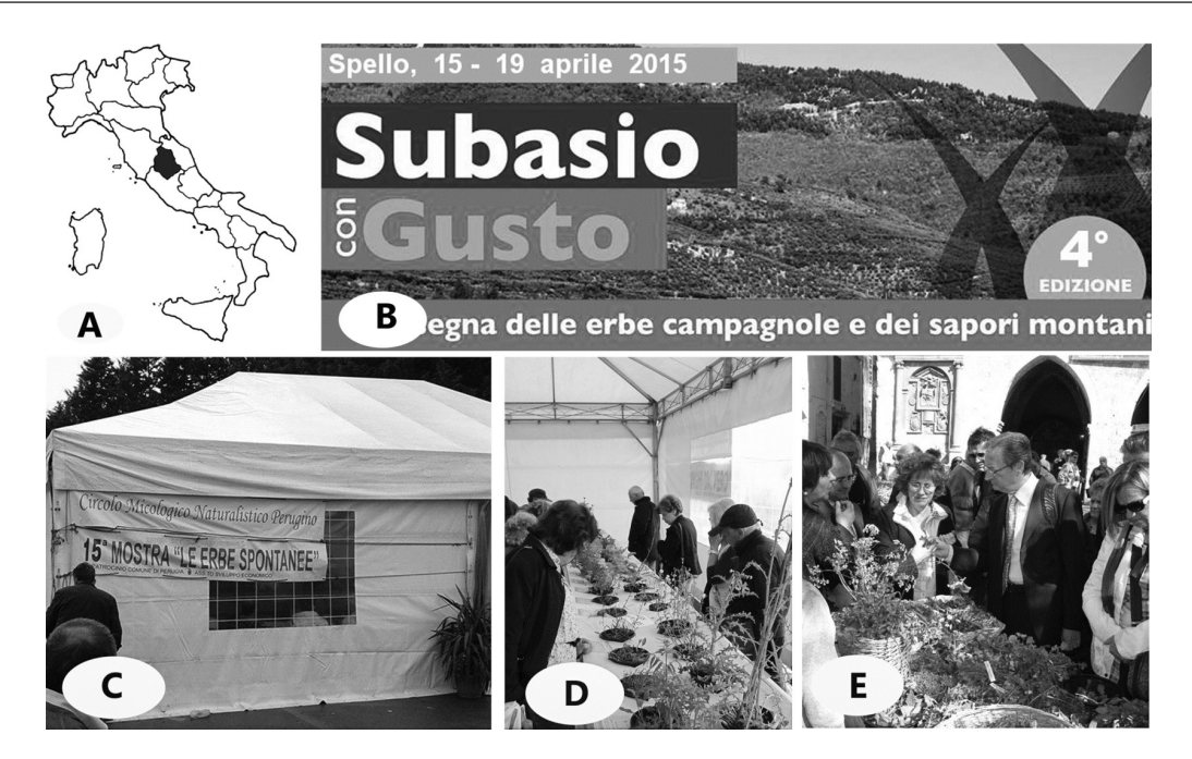
Fig. 1: Study area and some local events on edible wild plants in Umbria, Central Italy.

on numerous wild plants. Various samples of the two species were collected, analysed with a stereomicroscope SX45 (Vision Engineering Limited), determined and classified according to the Checklist of Italian Vascular Flora (CONTI et al., 2007). All the exsiccata of the aforementioned species are preserved in the Erbario PERU of the Università degli Studi di Perugia.