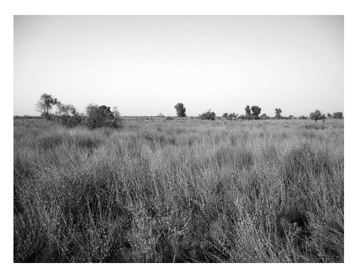
Fig. 2: A. pictum stand, flood plain of the Layi River, i.e. a river branch of the Tarim River, Qongaral, Korla, Xinjiang, China (Photo: N. Thevs, Sept. 2008).