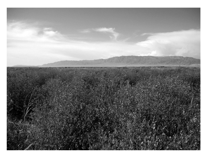
Fig. 1: A. venetum stand, flood plain of the Ulungush River, Aleghak, Altay Prefecture, Xinjiang, China (Photo: N. Thevs, Sept. 2008).

In this paper, we present a comprehensive review on the two species Apocynum venetum and Apocynum pictum , focusing on biology, phytogeography, ecology, planting techniques, and utilization. We will draw conclusions on the utilization potential of these two species and point out open research questions. The term Apocynum is used, when we refer to both species A. venetum and A. pictum