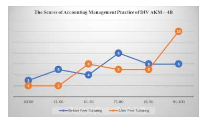
Figure 2. Gain Scores of Accounting Management Practices of DIV AKM – 4B

Last, from Figure 3 we can see that the students of DIV AKM - 4E who get score above 70 increased from 22 to 26 students. Meanwhile, the students who get the score of below 70 decreased from 11 to 7 students.