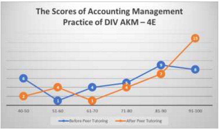
Figure 3. Gain Scores of Accounting Management Practices of DIV AKM - 4E

Last, from Figure 3 we can see that the students of DIV AKM - 4E who get score above 70 increased from 22 to 26 students. Meanwhile, the students who get the score of below 70 decreased from 11 to 7 students.