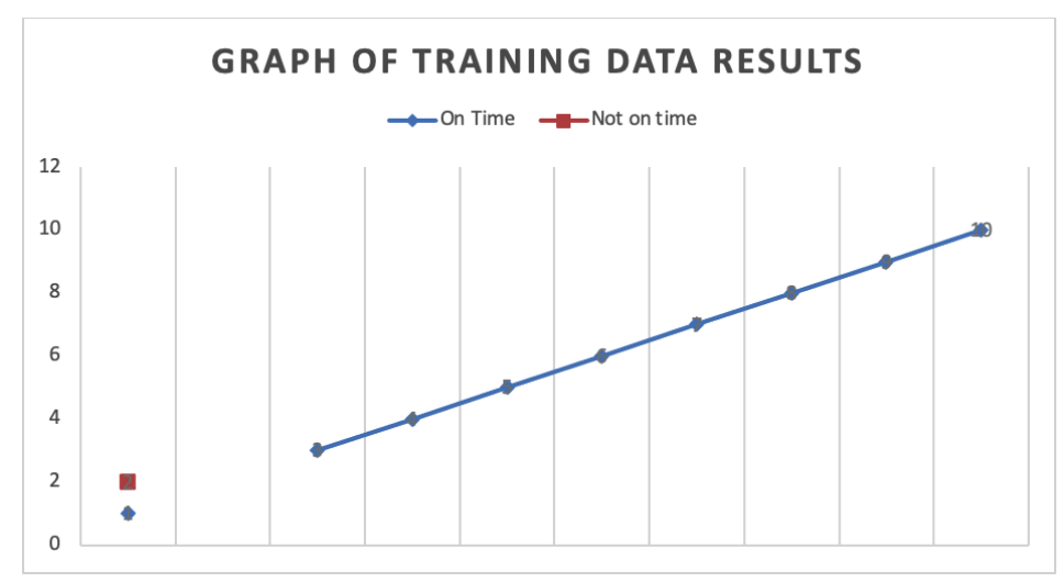
Figure 3. After obtaining the results, it can be seen that the test results have an accuracy rate of 90%.