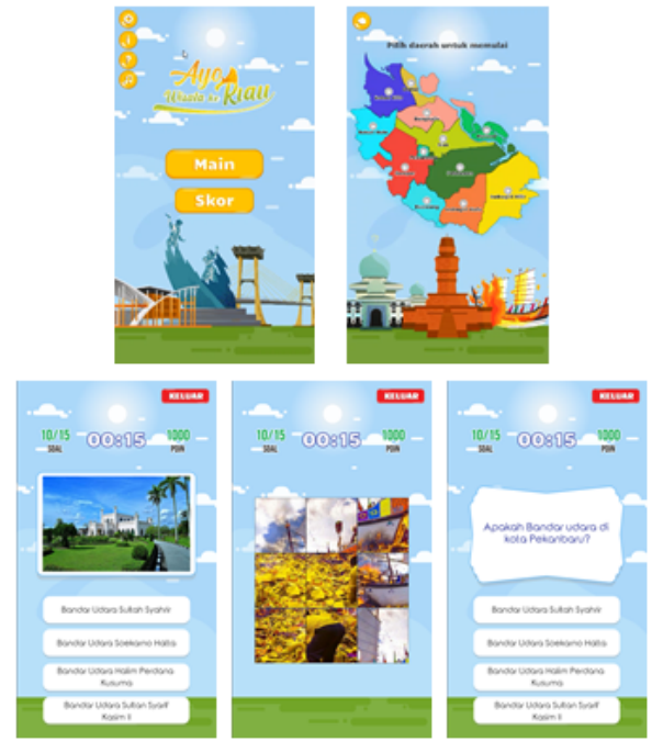
Fig. 3 The new digital prototype of 'Ayo Wisata ke Riau'

The prototype is again tested and evaluated based on the user's perspective, so that later the prototype can be properly implemented in the form of a mobile game software product that is ready to be published.