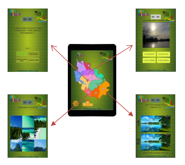
Fig. 1 The old Ayo Wisata ke Riau' Educational Game Application

The result of the development of educational mobile game products is an Android-based application, as in Figure 1 below.