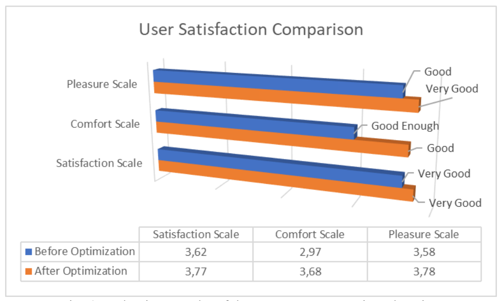
Fig. 4 Evaluation Results of the Prototype 'Ayo Wisata ke Riau'

In accordance with the provisions of the quality measurement metric used, based on the scores contained in table 3 previously, each metric is categorized into 4 levels, namely Poor, Fairly Good and Very Good so that the comparison of the values can be seen in Figure 4 below.