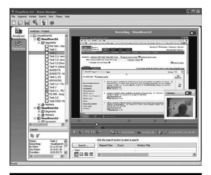
Figure 2. Screenshot of Morae Recorder Analysis Tool

Usability study participants were recruited by posting an announcement to the JMU students' Web portal. A $25 gift certificate was offered as an incentive, and more than 140 students submitted a participation interest form. These were sorted by the number of years the student(s) had been at JMU to try to get as many novice users as possible. Because so much of today's student work is conducted in groups, four groups of two, as well as four individual sessions, were scheduled, for a total of twelve students. JMU librarians who had received both human-subjects training and an introduction to facilitation served as facilitators to the usability sessions. Their role was to watch the time and ask open-ended questions to keep the student participants talking about what they were doing.