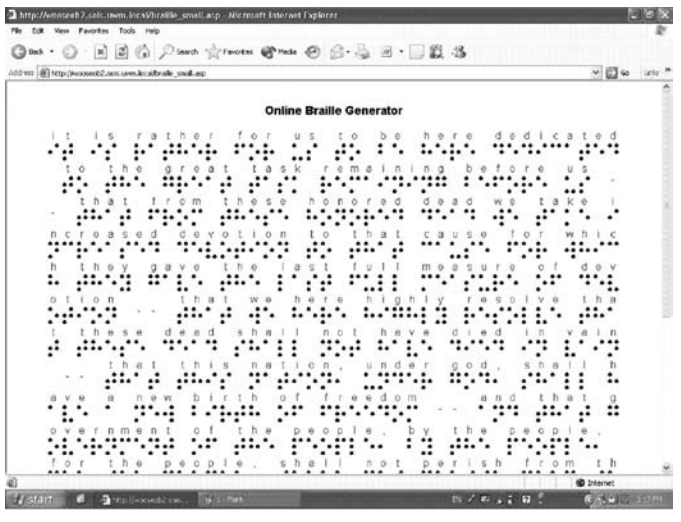
Figure 3. Touchable braille output screen

regional annual meeting for the blind. Each session lasted no more than 60 minutes. Participants were asked to try different interfaces of force feedback Braille outputs with various dot sizes and magnitudes of force. They used a tactile mouse on a notebook computer; after exploring every option, they were asked to select the most comfortable settings for their