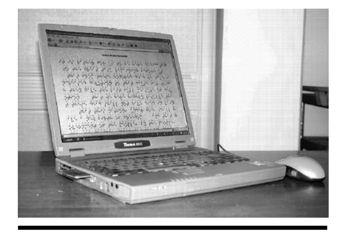
Figure 1. Experimental setting