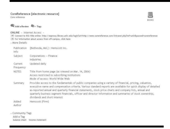
Figure 3. Encore community tag

of the Encore result display and becomes an indexed keyword for searches in Encore (see figure 3). If that tag term is searched in Encore's keyword search, the bibliographic record attached to that tag term will be included in the results list under the community tags facet. Since these community tags are searchable, subject liaisons can add keywords to Encore records without collaboration with cataloging staff. However, this provides limited success because the keyword is included and indexed only in Encore records—not in the OPAC records. Also, the community tags facet must be selected from the results display for the Encore record tags to be searchable.