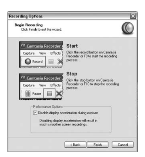
Figure 7. Begin recording

I found Camtasia Studio to be very user friendly, although I cannot emphasize enough how important it is for librarians to collaborate with their IT staff. This software enables you to bring the classroom to the student when they need it. You may have instructed a class on library research, but many of these students