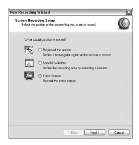
Figure 3. Screen recording setup