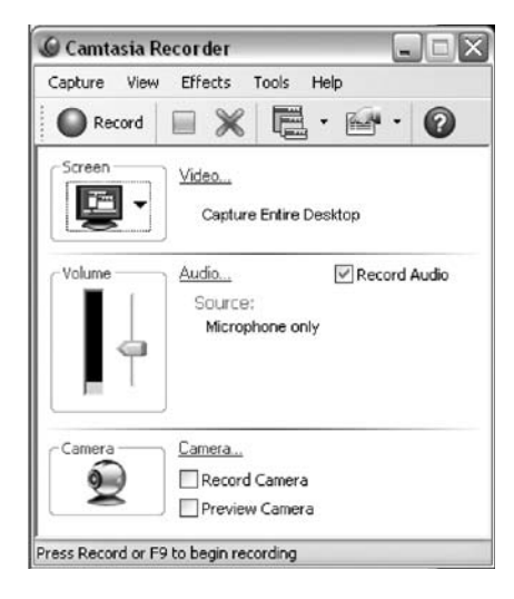
Figure 8. Camtasia recorder

Finally, and most importantly, work with your IT staff on all phases of your project. By developing a collaborative relationship with them you will have fewer bumps in the road. Use your imagination: the sky is the limit.