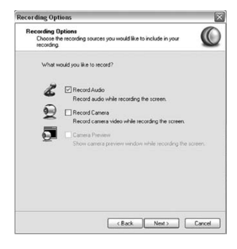
Figure 4. Recording options