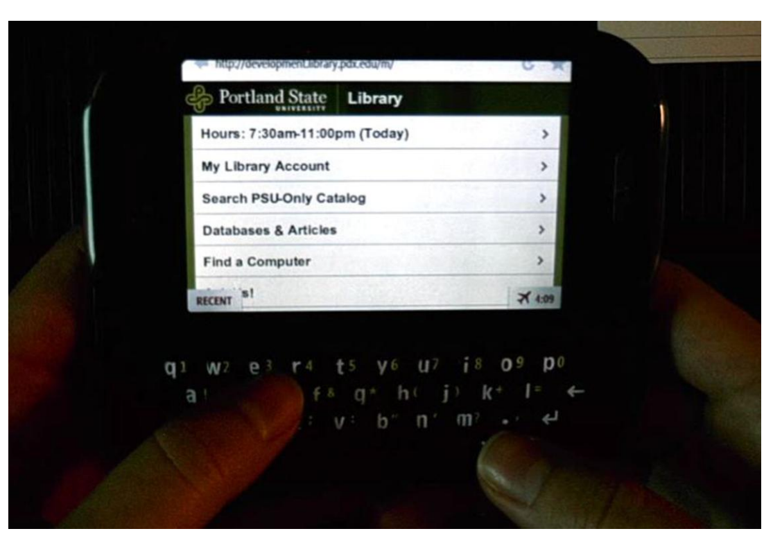
Figure 2. Video Still from Test Session Recording

The test session consisted of two parts: the completion of five tasks using participants' phones on our test website recorded under the document camera, and a post-test survey. Participants were read an introduction and instructions from a script in order to decrease variation in test protocol and our influence as the facilitators. We also performed a walk-through of the testing session prior to administering it to ensure the script was clearly worded and easy to understand.