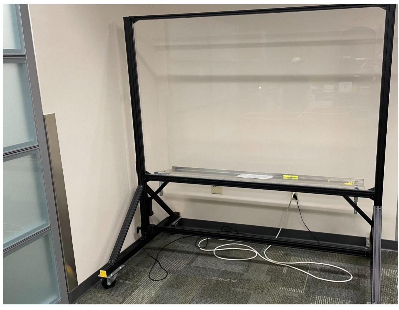
Figure 1. The lightboard that the Library received.

The lightboard was used by a few instructors who frequented the Studio over the years. During fall 2019, one faculty member from the College of Natural Resources regularly used the lightboard two to three times per week for about 45 minutes to an hour per session. Another engineering faculty member, whose students built the lightboard, also used the lightboard several times but did not have a regularly scheduled appointment. There had not been any regular users since then.