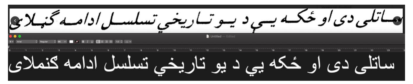
Figure 5. Sample line image and corresponding text.

The dataset is organized in a hierarchical structure consisting of directories, where each directory contains line subdirectories which hold line images and its texts. The dataset is openly available at GitHub (<u>https://github.com/yhan818/Pashto-Dataset</u>).