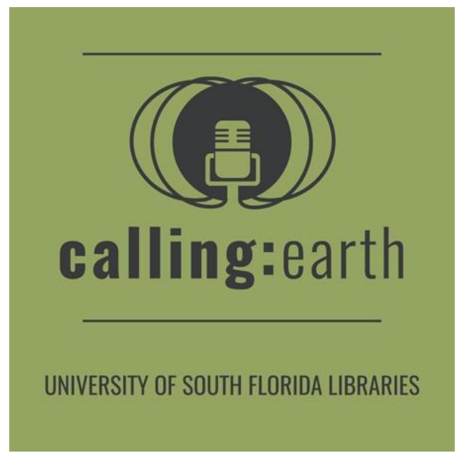
Figure 1. Season 1 Logo