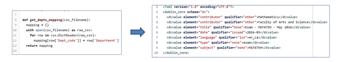
Figure 2. A screenshot of the UTL script generating Dublin Core metadata from filenames.

Once metadata is generated, the second Python script (figure 3) packages the PDF and metadata file into a DSpace Simple Archive (DSA) which is the format that DSpace accepts for batch ingests.