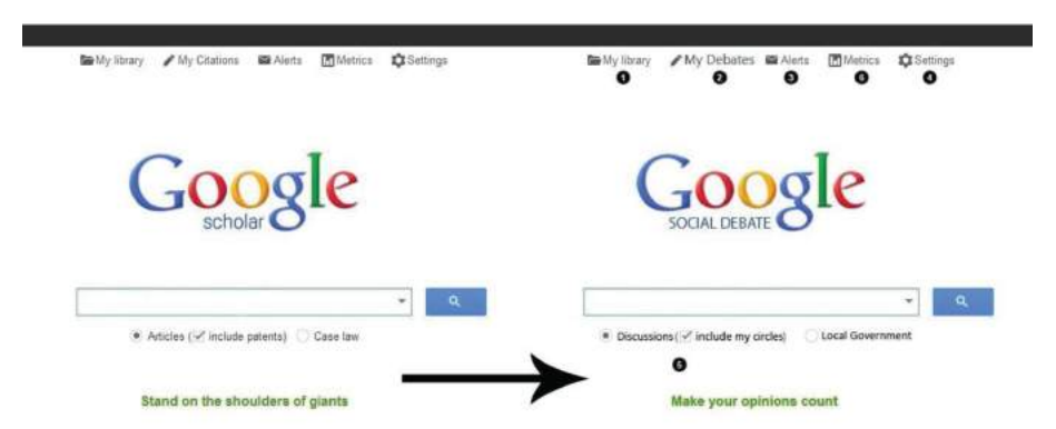
Figure 1 – Photomontage representing the possible interface proposed for Google Social Debate.

Google Social Debate would use text mining techniques (as previously described) in order to "measure" words written by users and calculate indicators of discomfort related to pre-established categories. Even if there is no reference to take from Google Scholar for spatially distributed data, the "metrics" used on this platform (and other academic databases) give a hint on how the resulting indicators could be expressed.