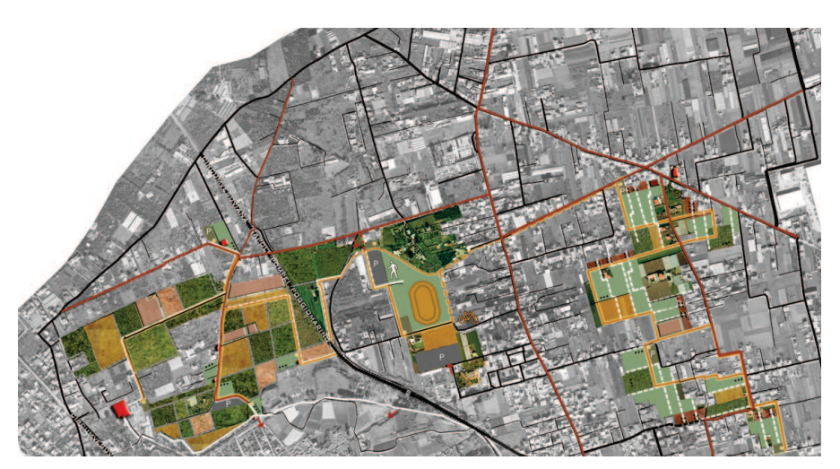
Figure 4 – Area north of the archeological site

Likewise for the Sarno River fluvial strip, lying between "via Plinio" to the north and the A3 motorway to the south and divided by the railway line. A proposal has been forwarded for the recovery of some existing buildings for use as a compact accommodation structure, connected directly to the archeological sites and equipped with arts/cultural and conference facilities with an auditorium: a place where archeology, history and faith become the object of study and reflection, putting in motion a process which enhances the heritage of Pompeii that has the potential to go beyond the mere exploitation of an ephemeral and inconsistent tourism industry.