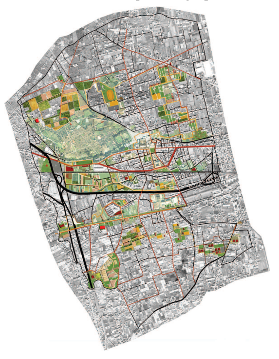
Figure 1 – Overview of the projects for Pompeii

Through urban planning, judgments are expressed on space-places; possible transformations of the original structures are examined, introducing a technique for addressing and interpreting the reality that "informs" the various issues of transformation, providing specific solutions.