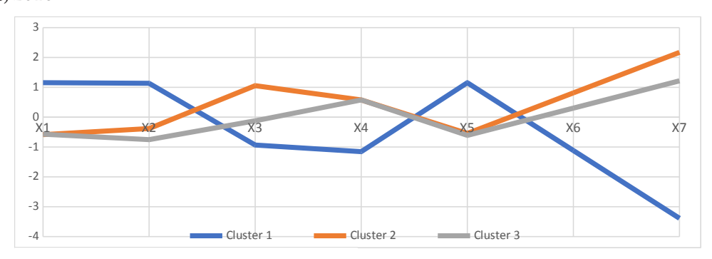
Figure 3. The configuration of the distances of cluster formations using the method of \kappa -means in approaches to startup acceleration and incubation process

Network (GAN) and one of the first ten accelerators of the entire world, AlphaLab has invested and collaborated with 113 companies, including 12 acquired companies. AlphaLab network consists of leading entrepreneurs, investors and mentors in the Pittsburg region and other countries. Success stories, related to startups in the highly-developed companies, include NoWait (acquired by Yelp), Jazz, Black Locus (acquired by Home Depot), Shoefitr (acquired by Amazon) and The Zebra. AlphaLab is also a part on the startup stage of a seed fund, which has invested over 50 million UD dollars in more than 160 companies, which jointly raised over 1.3 billion dollars. These companies include ModCloth, 4Moms, Civic Science, mobile technologies (acquired by Facebook Facebook) and ShowClix. In general, analysing structural elements of the enterprises of the third cluster, it should be noted that, according to their characteristics, these enterprises have a more selective approach to consideration and acceleration, as well as incubation of new projects. In order to compare the difference in approaches to the above-stated process, we have calculated a configuration of the distances of cluster formations using the method of \kappa -means (see Figure 3).