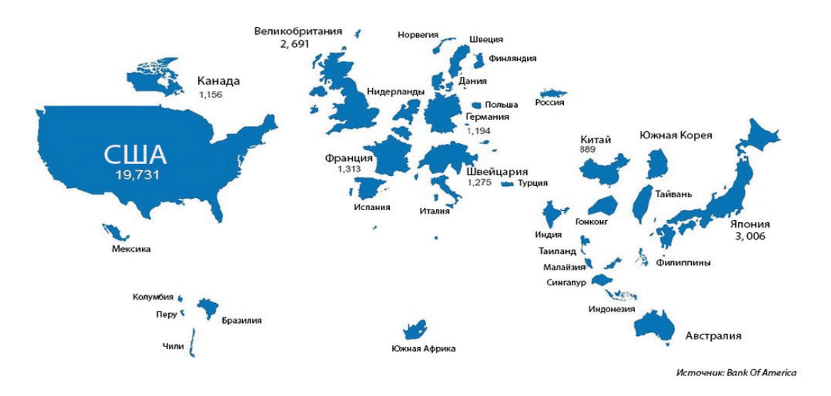
Fig. 2. The world according to free-float equity market capitalization ($bn)

Firstly, the banks in the Ukrainian banking system are two small in relation to the world banks. The assets of all Ukrainian banks are lower than the assets of the largest world banks (look table 4).