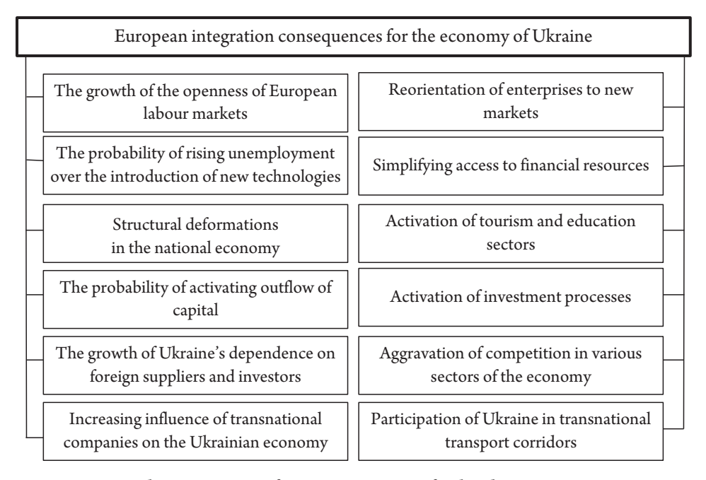
Fig. 2. Determining the consequences of European integration for the Ukrainian economy

The choice of the latter criterion is determined by the fact that the consequences of European integration are not immediately evident. Thus, it is expedient to