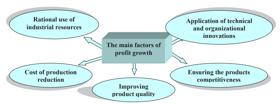
Fig. 1. The main factors of increasing the profit of an enterprise

these positions, the production profitability can be interpreted as one of the most important factors in the quality of the enterprise management.