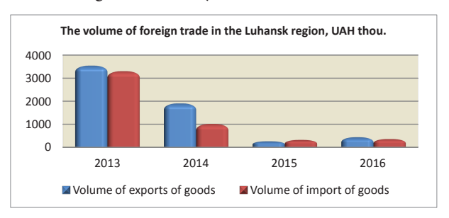
Fig. 3. The amount of foreign trade in Luhansk region

The negative dynamics of economic indicators in Luhansk region is even greater than in Ukraine as a whole. Figure 3 shows the dynamics of foreign trade in Luhansk region in recent years.