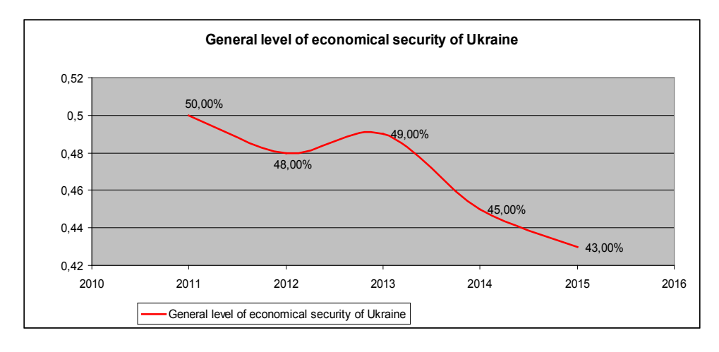
Fig. 2. Dynamics of the integral indicator of the level of economic security of Ukraine in 2011–2015, %