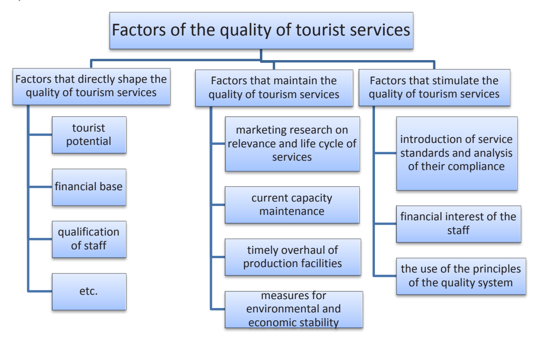
Fig. 1. Factors of the quality of tourist services