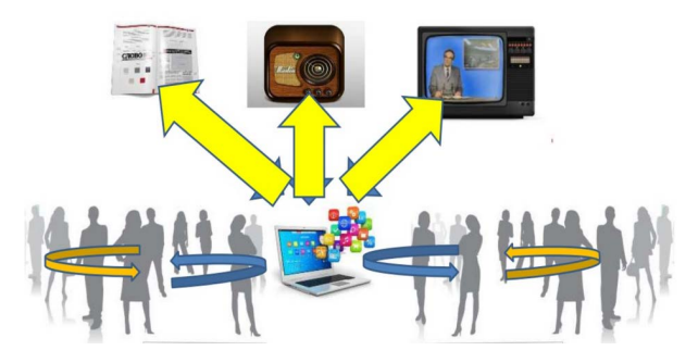
Fig. 3. Communication Model Today