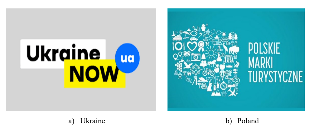
Figure 1. Brand's logo

In 2012, the "I Like Poland" project was launched, aimed at increasing Poland's competitiveness in Asian markets – namely China, India and Japan. The project implementation was meant to increase the revenues and expenditures of international tourists from these countries. In addition, as part of cooperation with the EU in 2010–2012, the project "Eastern Poland Promotion" was implemented. It was aimed at increasing interest in the tourism offer of the five voivodeships of Eastern Poland, focusing on domestic (including residents of Eastern Poland) and international tourists (Germany, Ukraine). With the help of the Polish government a number of successful programs to promote domestic tourism (in particular, "Poland See More – Weekend at half price") have been