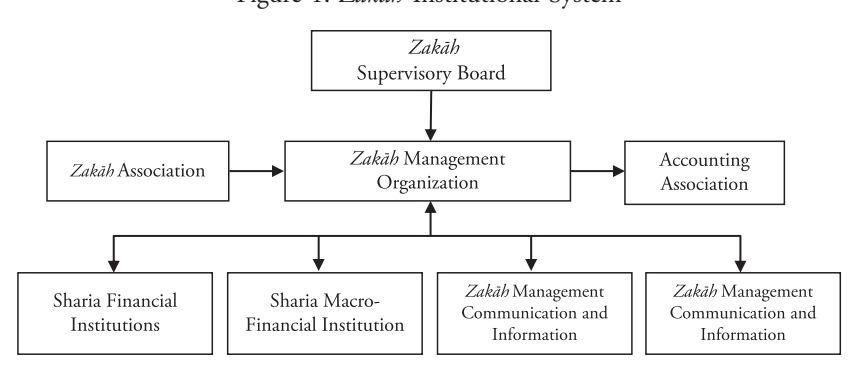
Figure 1. Zakāh Institutional System

Figure 1 on the Bank Indonesia Version of the Zakāh Institutional System illustrates the interrelationship between one institution and others.