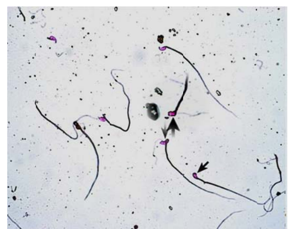
Fig 2: abnormal sperm (HA -Head abnormality) Eosin Y stain , 400x Showed Head abnormality