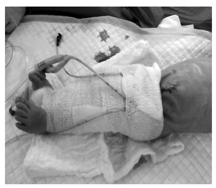
Postoperatively every patient was immobilized by means of Bryant's traction