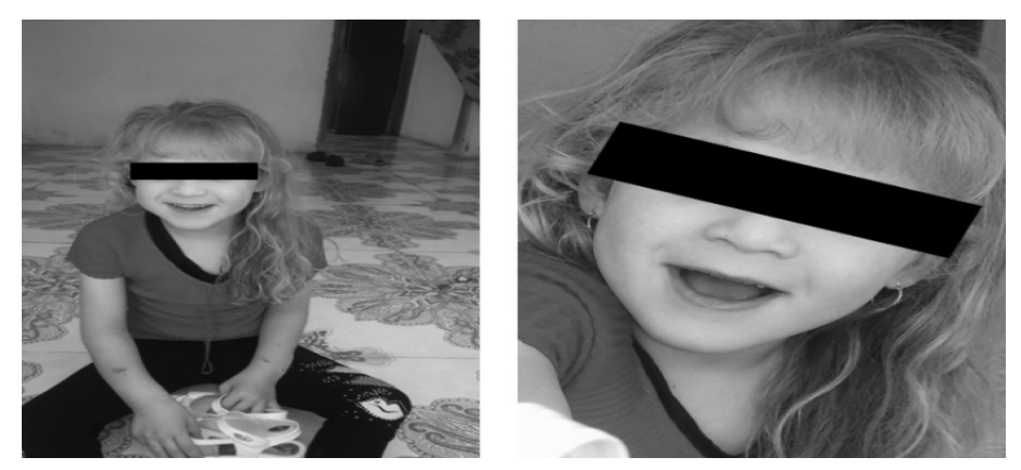
Fig (1): Facial appearance of the 8 - year old child with Angleman Syndrome. Fair complexion, blond hair and subtle dysmorphic features like prominent jaw (prognathism), pointed chin, broad and flat nose, broad forehead, long face, happy and smiling demeanor.