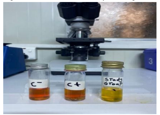
Figure (3): Cystine Trypticase Agar mannitol fermentation test by M.S

All isolates were gram positive cocci , M.S is catalase negative and ferment of mannitol by CTA (Figure 3).