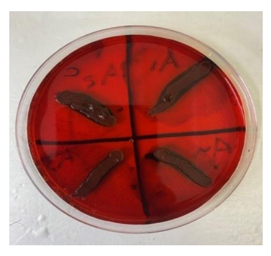
Figure (2): Biofilm formation by mutans Strepto-cocci on Congo red agar

All isolates were gram positive cocci , M.S is catalase negative and ferment of mannitol by CTA (Figure 3).