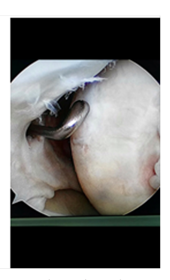
Figure 2 chondral lesion