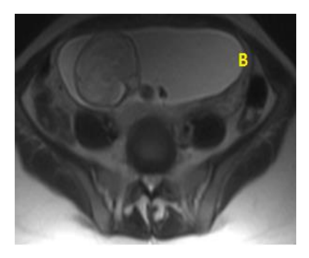
Picture 1: MRI showed: A. Left heterogeneous mass & B. The gestation sac.