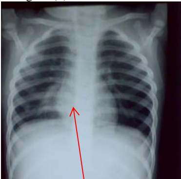
Figure (4) a: Total collapsed right lower lobe B- Totally expanded right lung post bronchoscopy by FB. (Sunflower seed)

CXR can show emphysema on one side due, to the act of the FB as a check valve, permitting the air to enter during inspiration and stay there during expiration (Obstructive emphysema) as shown in figure (5)