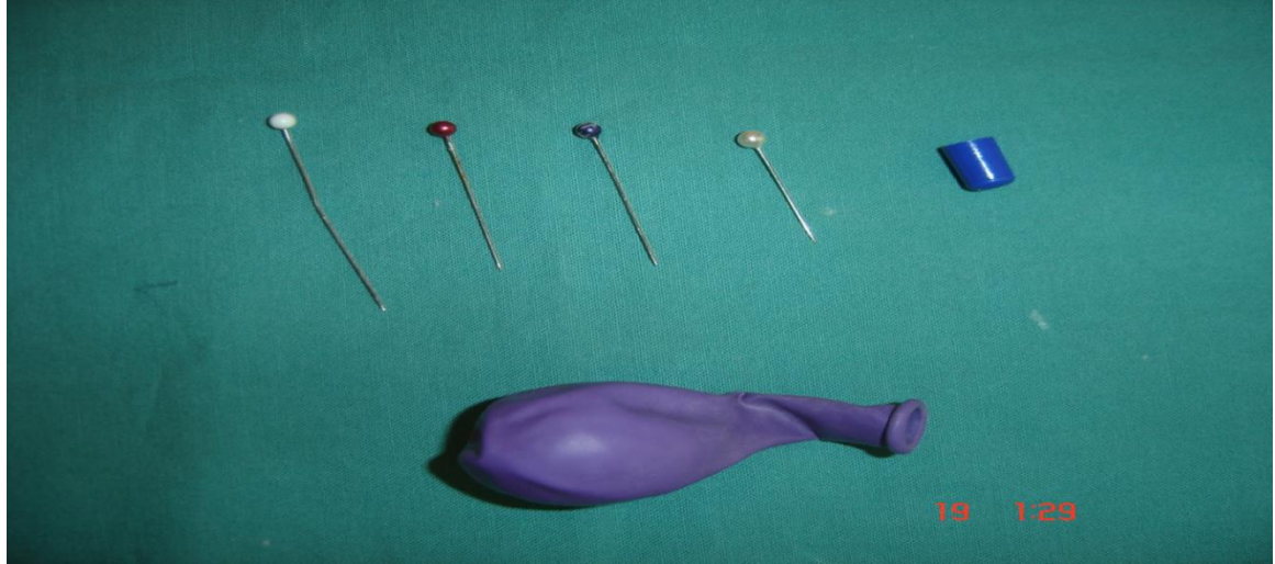
Figure (2) Inhaled FB removed successfully by Bronchoscopy under GA. Chest X-ray is useful especially in a radio opaque FB, which will cast a shadow on the X ray, Unfortunately some of our colleagues, immediately request CT scan to check for FB, this should be so limited to avoid hazards of radiation to the child. Radio opaque FB (Pin) seen on Chest X-ray, Figure (3)