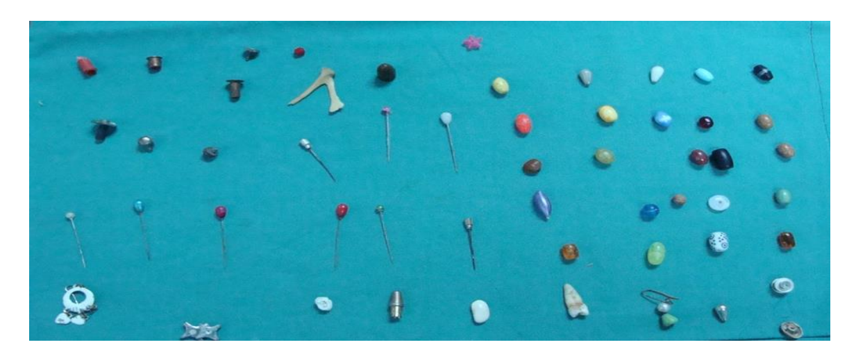
Figure (1) Different kinds of inhaled FB removed successfully by Bronchoscopy under GA.

Most of those children were below three –years. History of the inhalation of the foreign body is very important to ask for, as a positive history is diagnostic of the event of inhalation and bronchoscopy is the procedure of choice to retrieve the F.B. The problem we face that in some children, with no witness for the inhalation and presented with continuous cough and dyspnea for more than two week, and fail to respond to a proper medical treatment, Bronchoscopy is indicated as in 2/3 of these children turned to have FB in their bronchi, with the complete cessation of all respiratory symptoms after bronchoscopic removal of the inhaled FB. Figure Different types and shapes of FBs are shown in Figure (1) and Figure (2)