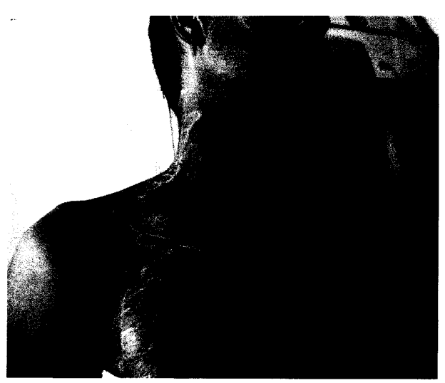
Figure (3) surgical approach