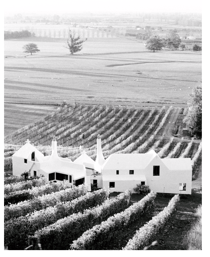
Fig. 4 Athfield Architects (1980–81). Buck House, Te Mata, Hawke's Bay.

which sounds very prescriptive, but it wasn't. Warren and Mahoney were best when we had a unique function to build for, and we were worst when it was so much floor space [gesturing vertically], in office buildings.