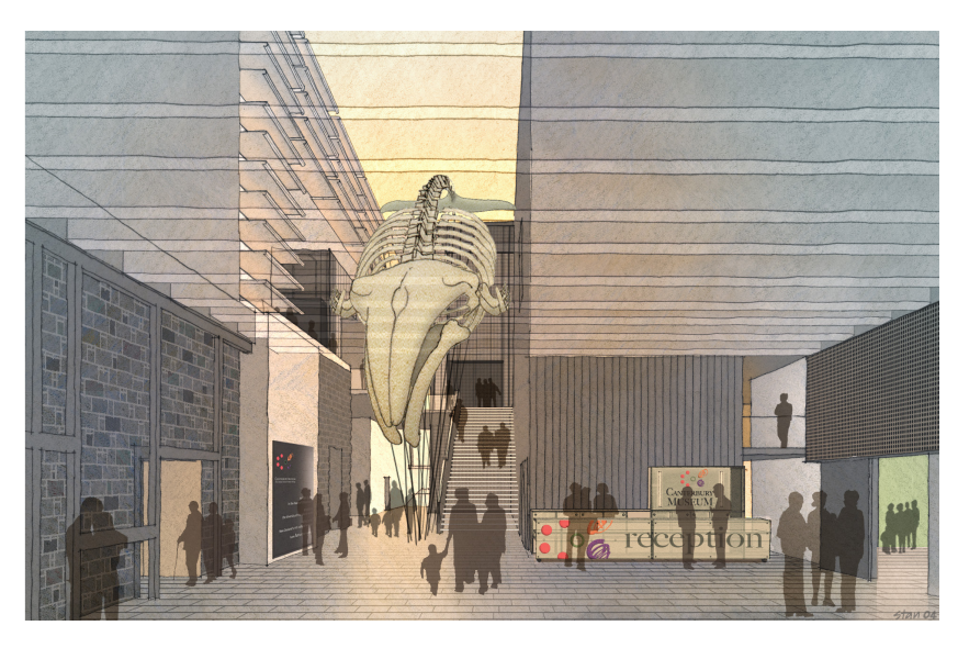
Fig. 6 Ian Stantiall for Athfield Architects (2004). Design for the revitalisation of the Canterbury Museum [Digital drawing]