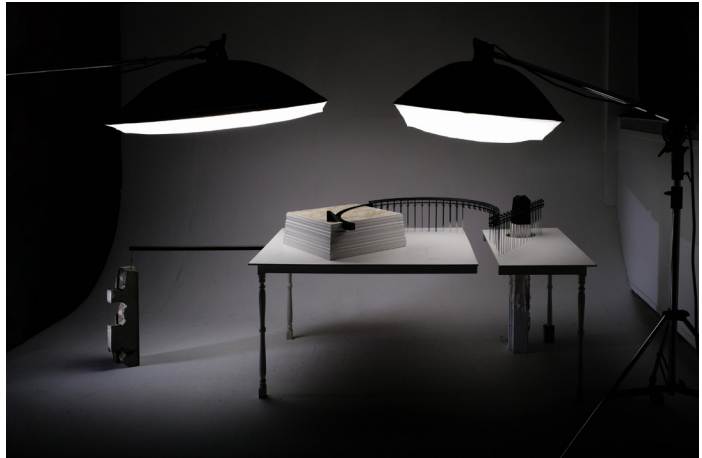
Fig. 9 Tom Collins (2022). Descent onto the unknowable terrain of Grafton Gully's forested motorway island. [Digital collage]