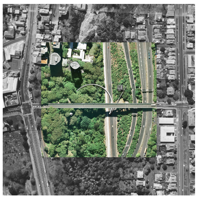
Fig. 3 Tom Collins (2022). Wallpaper archive and pedestrian bridge site plan, aerial photographs from 1963 and 2017. [Digital collage]

innovative ferro-cement structure at the time of its completion in 1910—the pedestrian bridge is a timber and steel structure that projects outwards from the archive, circling beneath Grafton Bridge, but above the motorway, before reversing at a tangent back towards the motorway island (Fig. 4). The lightweight framing and diagonal bracing of the pedestrian bridge recall an earlier timber and cable-stayed bridge constructed in 1884 but demolished to make way for its ferro-cement replacement.