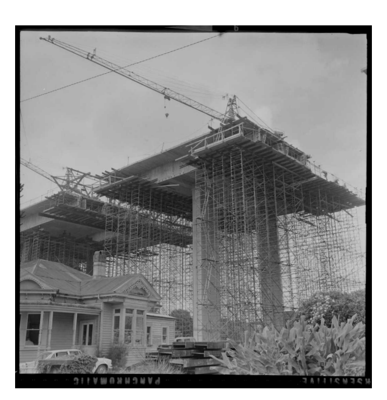
Fig. 1 Construction of the southern motorway viaduct, Newmarket.

An estimated 15,000 houses disappeared from the path of the motorway network implemented in Tāmaki Makaurau Auckland during the 1960s and 1970s, each forcibly acquired and demolished by the New Zealand government. Substantially emptying parts of the inner-city suburbs of Grafton and Newton, and displacing some 50,000 residents in the process, this action was justified by the government as "slum clearance." Over the following decades, the Central Motorway Junction proceeded to erase its own destructive origin from Auckland's collective memory through additions, planting, and a general habituation to the 'new reality.' Invariably, urban violence became historical indifference.<sup>3</sup>