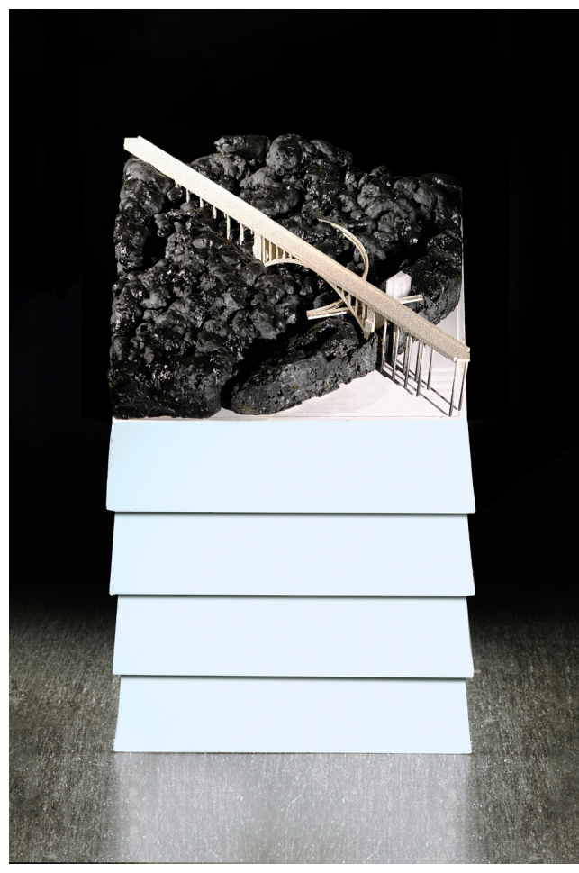
Fig. 4 Tom Collins (2022). Site model, western bridge embankment at rear, scale 1:500. [Expanding foam, rubber, MDF, acrylic, paint, recycled weatherboards, 520x520x600 mm]

The plan form of the proposed architecture also nods to the turning circle of a car at speed, a key determiner of the curvilinear language of the motorway itself. Contrarily, the structure of the pedestrian bridge intends a delicate filigree found with the prospect-gathering nature of the verandas of villas and bungalows—the typology that overwhelmingly constituted Auckland's lost suburbs (Fig. 5). If traditionally the veranda is reserved for the front elevations, themselves shielding and shading private domestic spaces behind, the proposed freestanding bridge imagines itself as a detached veranda whose inwards-facing orientation makes apparent both the absence of a supporting house and the outward scattering of suburban housing made possible by the motorway and suburbanisation it enables. By marking out a territory of absence this way, the bridging architecture