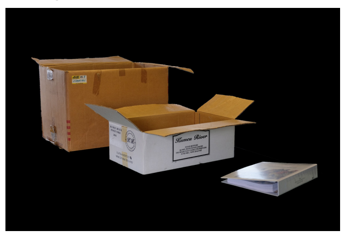
Fig. 2 Tom Collins (2022). Salmond Reed Architects' provisionally stored historic wallpaper collection. [Digitally edited photograph]

The implanting of a wallpaper archive here, at the base of the city's oldest cemetery, offers, through the most fragile of historical traces, a pivot calling up an ocean of lived settings and interior moments. Against the absurdly vast nature of the transport infrastructure defining this place, the catalyst for the archive is in fact the need to house, beyond a couple of cardboard boxes precariously holding them, wallpaper samples gathered informally by Salmond Reed Architects since 1994 (Fig. 2). Salvaged by the architects from historic building alterations, the collection was eventually analysed and catalogued by an archaeologist with the ambitious aim of providing a working measure for New Zealand's interior colonial heritage.<sup>8</sup>