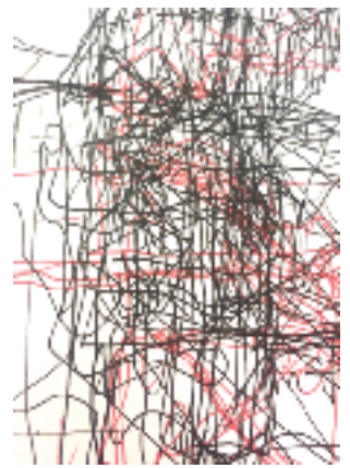
1. Drawing of space for/of an imagined maker-performer

Choreography and Architecture, combining practices: "Whirlwind or broom ride – Energy and Spinoza"